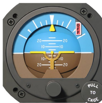
RCA26EK-13 MOVABLE POINTER

The RCA26EK Series of gyroscopic Attitude Indicators is the culmination of over 60 years of experience in gyro design. With the Multi-Volt feature, the RCA26EK can be installed in virtually any aircraft regardless of its power system. Designed as a direct replacement for the RCA26AK (14 volt) and the RCA26BK (28 volt) instruments, the RCA26EK is built with the same sturdy construction and quality you expect from R.C. Allen.