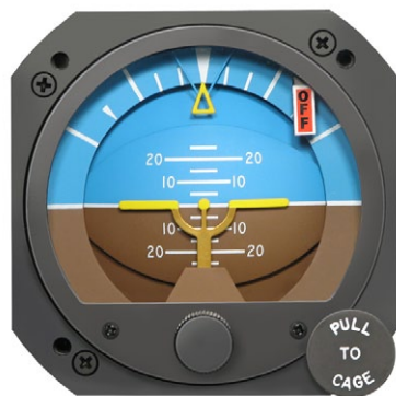
RCA26EK-11 FIXED POINTER